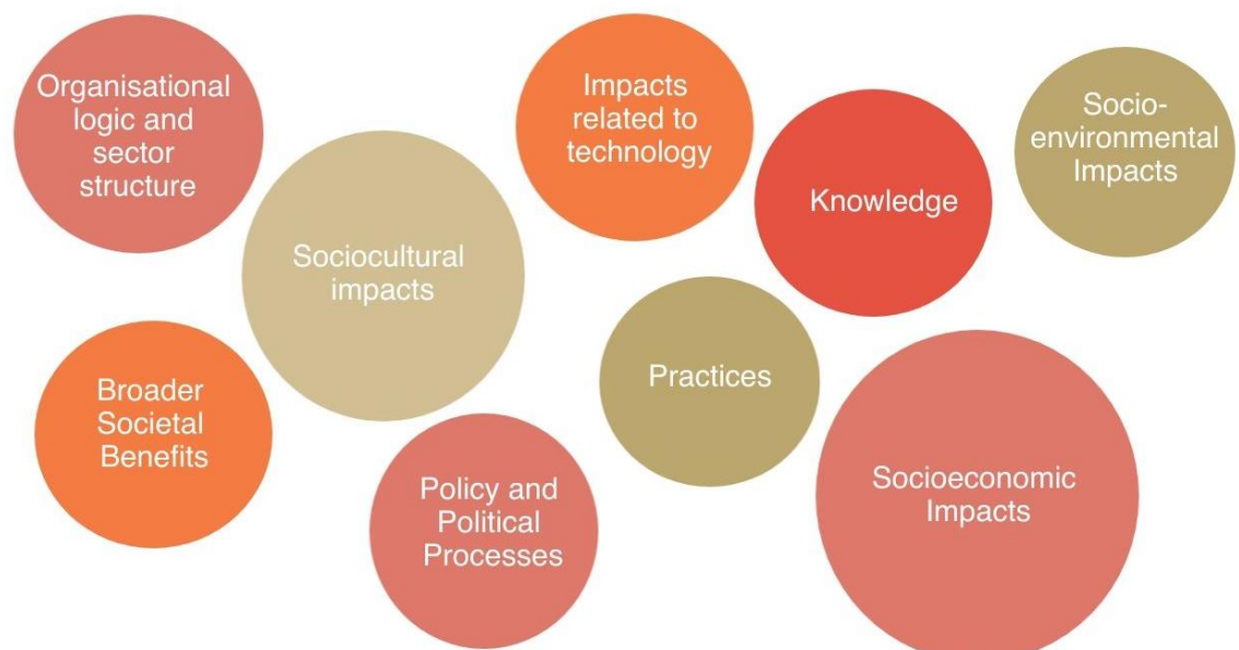
Graph 1: Social impacts associated with energy communities, grouped in key categories.

Through an intensive literature review, combined with stakeholder input and iterative feedback, we have collated a non-exhaustive, yet rigorous, set of indicators of the social impact of energy communities. For ease of access we have grouped them into key categories as can be seen in Graph 1. For an extensive listing of each category please click this link to view the interactive graph. We acknowledge that not all of these indicators are readily measurable and there might be overlap between them, but we believe that this consolidated mapping exercise can provide a useful, omprehensive overview of the multitude of social impacts that energy communities might offer.